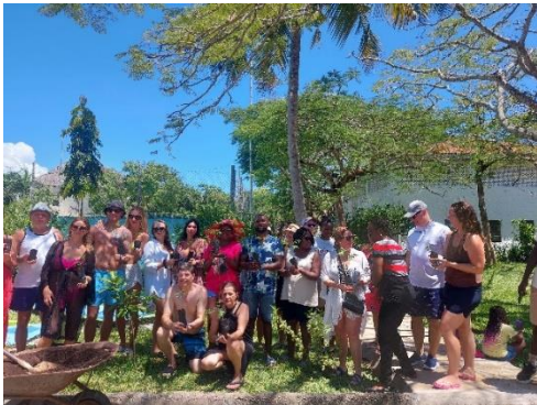
Hotel Annual Tree planting day where guests participate.

Even though our hotel meets the 50/50 land use threshold of built to green space. We strive to increase our green coverage.